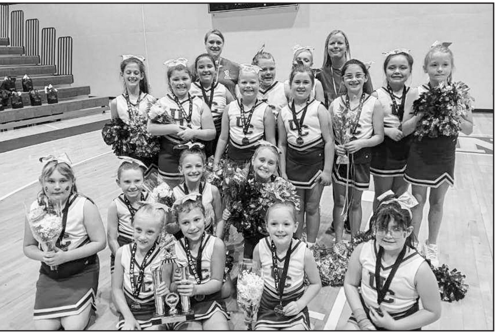
The Union County Recreation Department's 4th grade cheer team placed first at the Mountain Athletic Con-