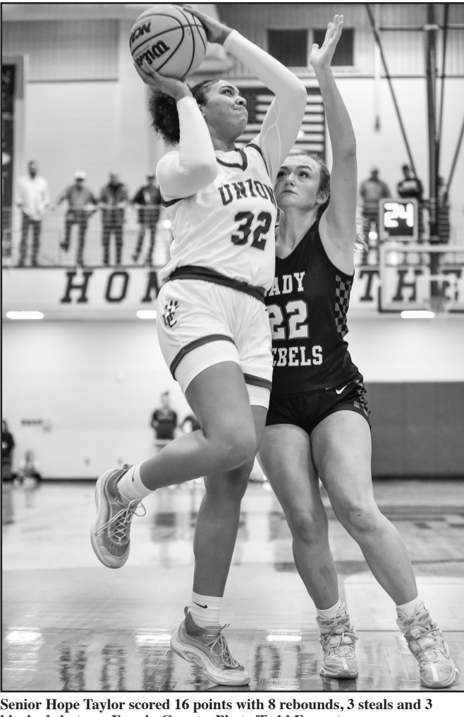
blocked shots vs. Fannin County.